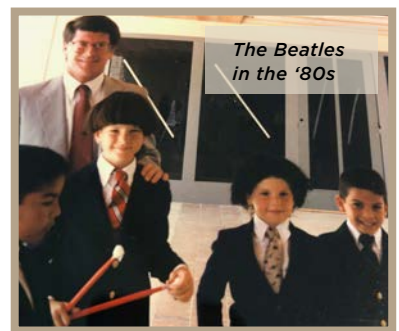
The Beatles in the ‘80s